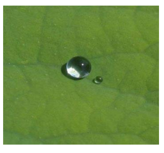
When dry, the material surface will slide off water like this leaf